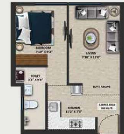
300 sq.ft. Floor Plan