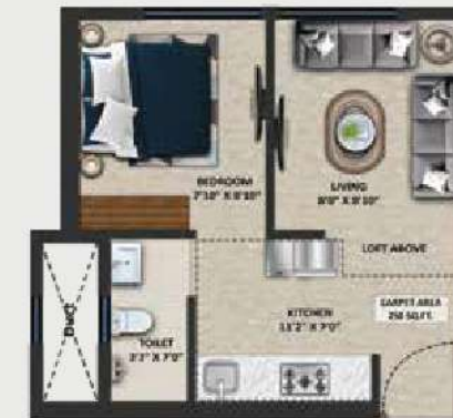
250 sq.ft. Floor Plan

Continuing the legacy of positive beginnings and intelligently designed homes, Aavyaan envisions to elevate and redefine contemporary living, creating remarkable, affordable luxury living spaces that are set to leave a mark in the real estate market. Aavyaan offers internationally acclaimed interiors, ingenious space utilisation, and unparalleled design details. Get ready for an exciting voyage into a realm of possibilities and exceptional living experiences!