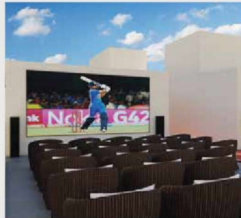
Open Air Theatre