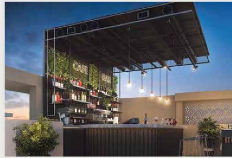
Open Sky Lounge