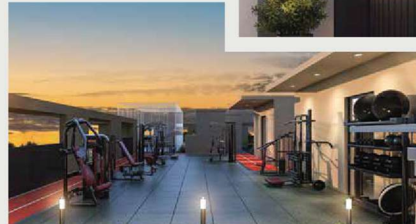
Open Terrace Gym