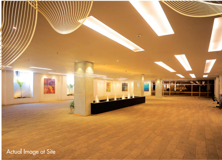
Actual Image at Site